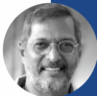
Chairman Shri. Nana Patekar Actor