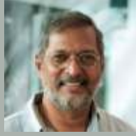
Chairman Mr. Nana Patekar Actor