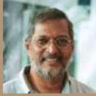
Chairman Mr. Nana Patekar Actor